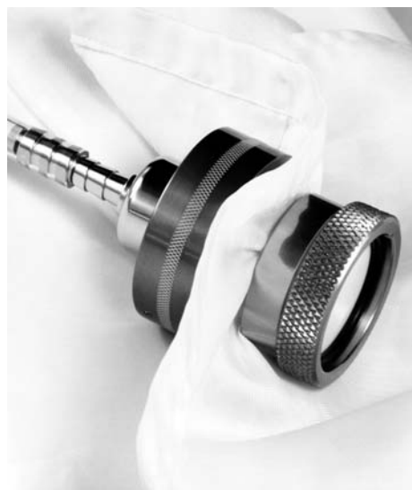
FIG. 2 Adapter

4.5 Cleaning and counting techniques are in accordance with those established in Section 10.