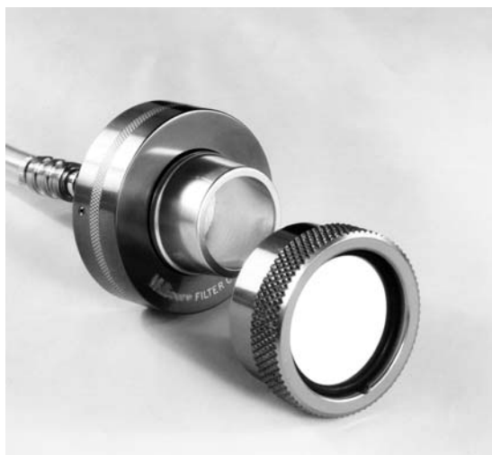
FIG. 1 Filter Assembly